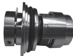
Grundfos Type E Value Guard Type VGM706C