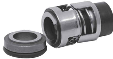
Grundfos Type B Value Guard Type VGM706B